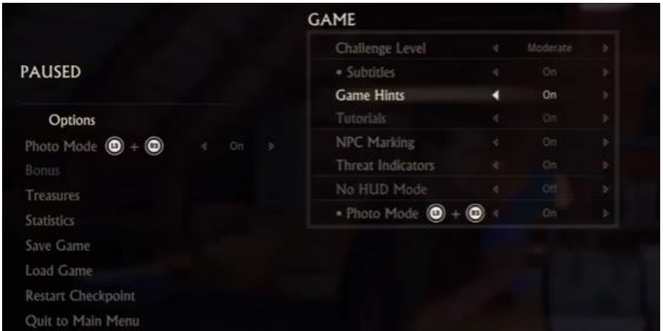
Figure 1. Bioshock Infinite Options Screen

There are video games that have incorporated these guidelines. Uncharted 4, an action-adventure video game, allows the configuration of several features, among them: difficulty level, subtitles, game hints and tutorials as we can see in Figure 1 .