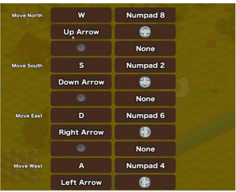
Figure 3. Sproggiwood Control Settings

An interesting feature is present in the game Sproggiwood, which allows to configure up to six key options to execute a command as we can see in Figure 3 . This feature is very important for people with learning disabilities or difficulty of pressing only one button at a time.