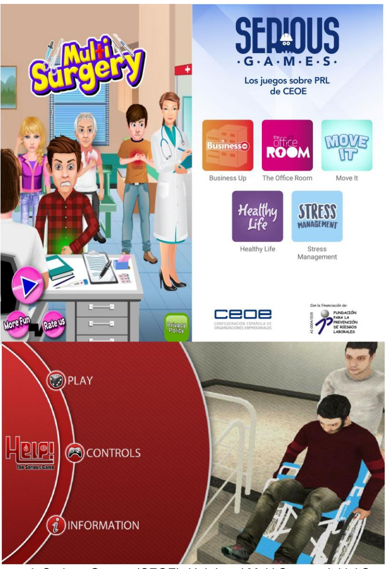
Figure 4. Serious Games (CEOE), Help! and Multi Surgery Initial Screen

These games were downloaded from Google Play and installed in a Samsung Galaxy S6 with Android 7.0 for their analysis, as we can see in Figure 4 .